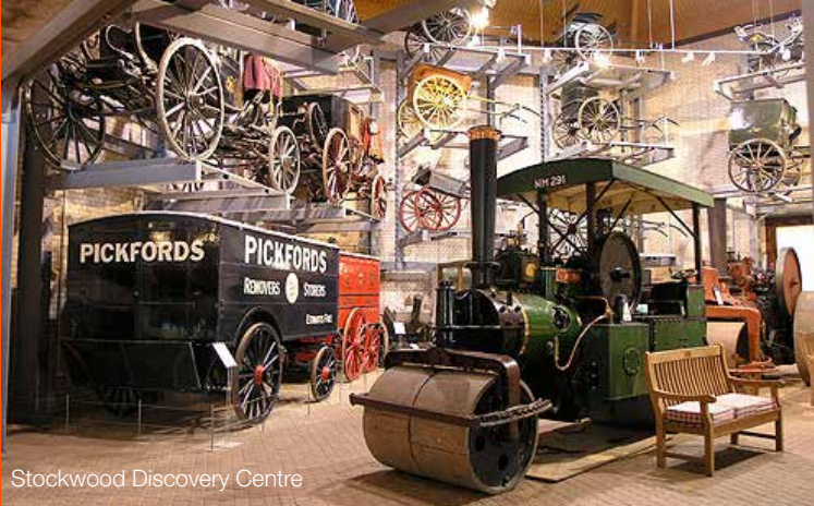
Stockwood Discovery Centre