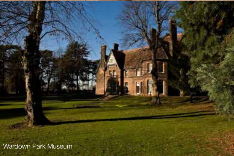
Wardown Park Museum