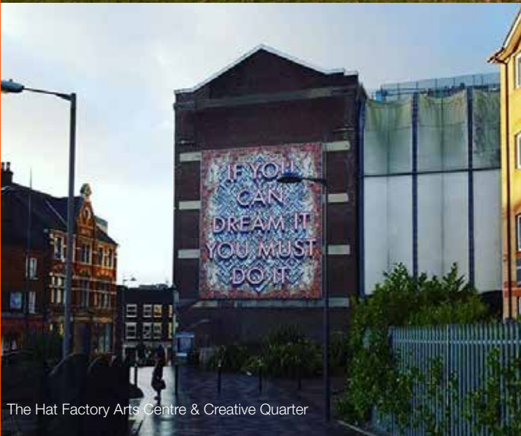
The Hat Factory Arts Centre & Creative Quarter